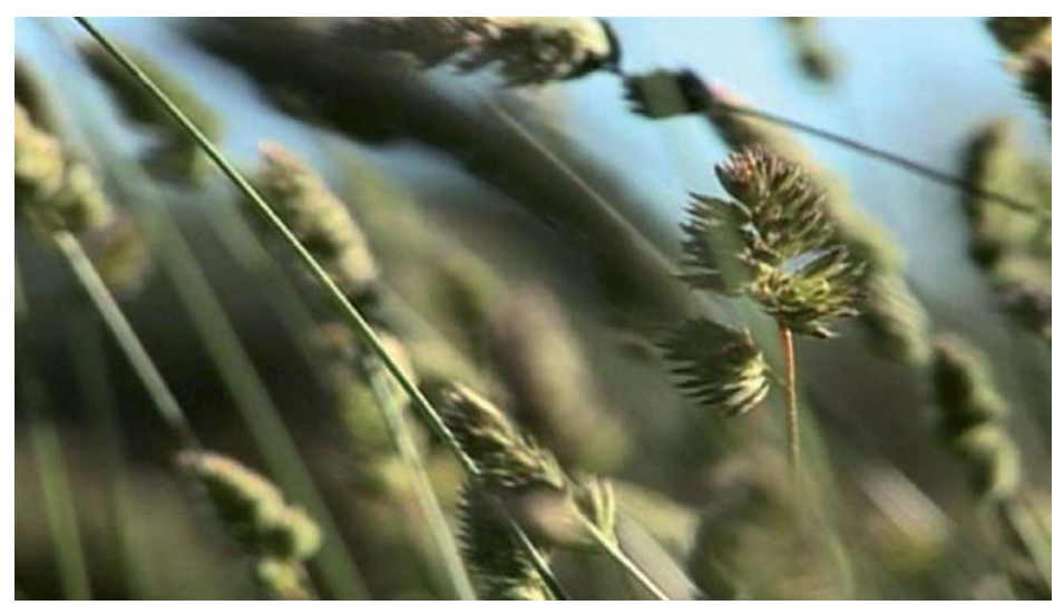
Scott Morrison (2009) oceanechoes, Video Still.

Despite the movement of the camera, its subject and editing, the constant focus on the grass at a continuous focal depth creates an overarching stasis within the otherwise moving video. oceanechoes expands the frame of the still image in order to include movement, yet the fixed gaze resists progression beyond the rhythms of the edits and soundtrack. So, when the video swings from the frenetic to the pensive, it seems as though these different facets are expanded elements of the same image and the video appears once again to be simultaneously moving and stationary.