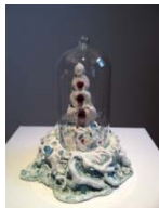
Aimee Fairman Lithocardite V: ...as twilight trembled under foot, 2013,

Acrylic on polyurethane resin, epoxy resin, synthetic turf, and glass dome, 24.5 x 20cm x 23cm