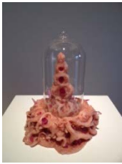
Aimee Fairman Lithocardite II: Universe of milk and ember, 2013

Acrylic on polyurethane resin, epoxy resin, velvet flocking, glitter and glass dome, 24.5cm x 20cm x 20cm