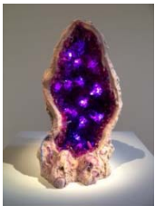
Aimee Fairman Lithocardite III: ...and she herself, a cave full of echoes, 2013

Prosthetics silicone, epoxy resin and glass dome, 24.5cm x 19cm x 19.5cm