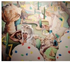
Kevin Chin Wild , 2013