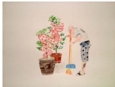
Lucy Griggs Reckoning Time 2 , 2013