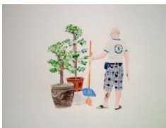
Lucy Griggs Reckoning Time 1 , 2013