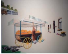
Kevin Chin Little Pieces (Orange Wagon) , 2009