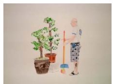
Lucy Griggs, Reckoning Time 3 , 2013