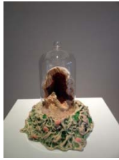
Aimee Fairman Lithocardite I: Now cry the stars when upon the earth, their gaze might rest a nostalgic burst, 2013,

Acrylic on polyurethane resin, epoxy resin, velvet flocking, glitter and glass dome, 24.5cm x 20cm x 20cm