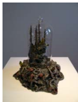
Aimee Fairman Lithocardite IV: You watched the sky with kaleidoscopic eyes, 2013

Acrylic and prosthetics silicone on polyurethane, resin, epoxy resin and LED lights, 46.5cm x 28cm x 31cm