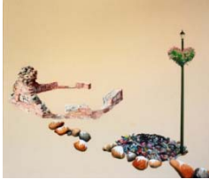
Kevin Chin Little Pieces (Bricks) , 2009