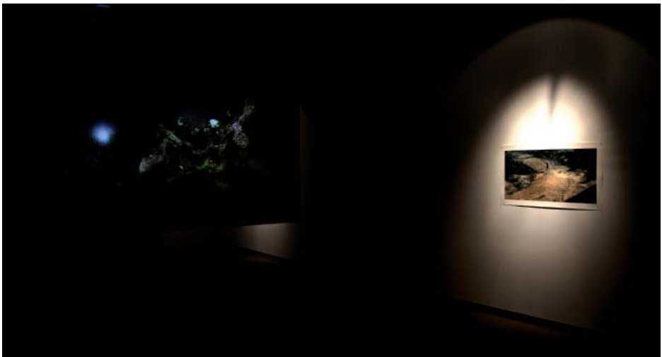
Hold (2010) Exhibition Detail (Eloise Calandre (2010) Cradle and David Mutch (2009-10) Untitled #10 ).

David Mutch's single photographic image Untitled #10 from The Tourist series (2009 -2010) depicts a carefully framed landscape marked by deep shadows and a washed-out colour palette. The landscape provides a background on which a single figure walks along a desolate unsealed road. Just as Yardley's work suggests narratives beyond the frame, this image speaks of the road travelled and the road yet to be travelled. This presumed narrative, evoked here in a photograph with a 16:9 cinematic ratio and carefully constructed aesthetic, suggests a cinematic freeze frame.