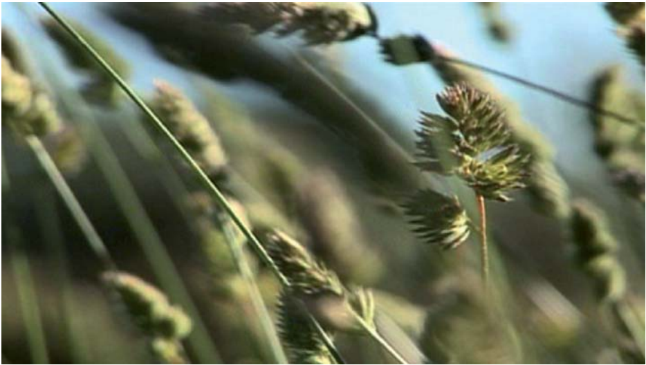
Scott Morrison (2009) oceanechoes , Video Still.

Despite the movement of the camera, its subject and editing, the constant focus on the grass at a continuous focal depth creates an overarching stasis within the otherwise moving video. oceanechoes expands the frame of the still image in order to include movement, yet the fixed gaze resists progression beyond the rhythms of the edits and soundtrack. So, when the video swings from the frenetic to the pensive, it seems as though these different facets are expanded elements of the same image and the video appears once again to be simultaneously moving and stationary.