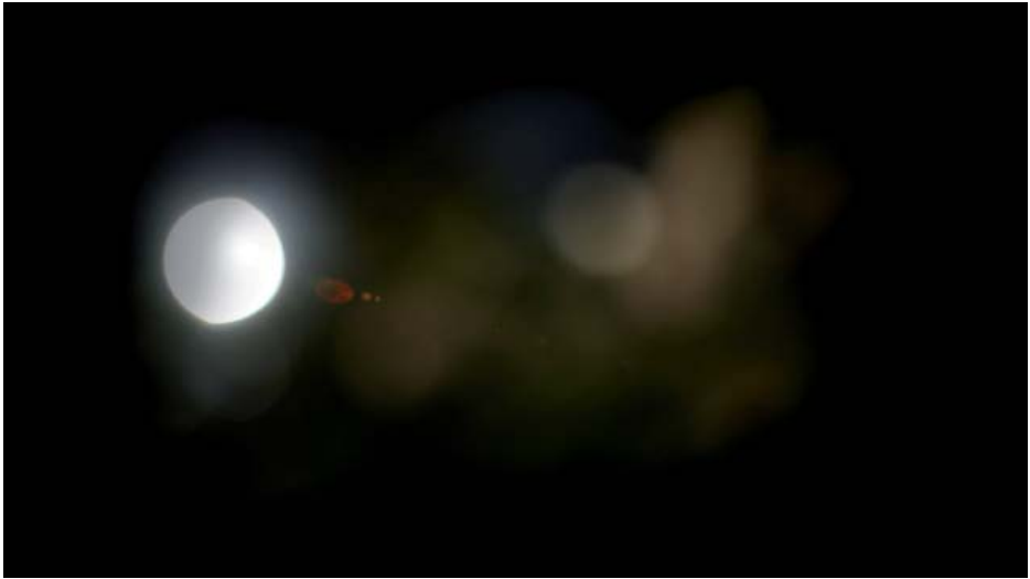
Eloise Calandre (2010) Cradle , Video Still.

specifically visual about this kinetic change. The effect is not only perceived visually, but it reproduces an effect of the human eye.