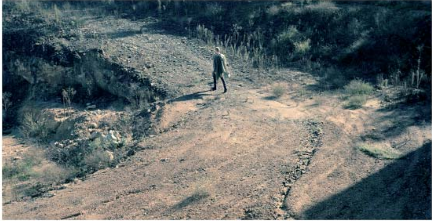
David Mutch (2009-10) Untitled #10 from the series The Tourist , Photograph.

Untitled #10 oscillates between photography and cinema, and in so doing reproduces the tension between stillness and motion at the heart of the moving image. The still photogram, which comprises all moving images, is erased by the projector's motion when viewed at twenty-four frames a second. Furthermore, the materiality of the image is erased in cinema as the sequence of stills is projected in motion.