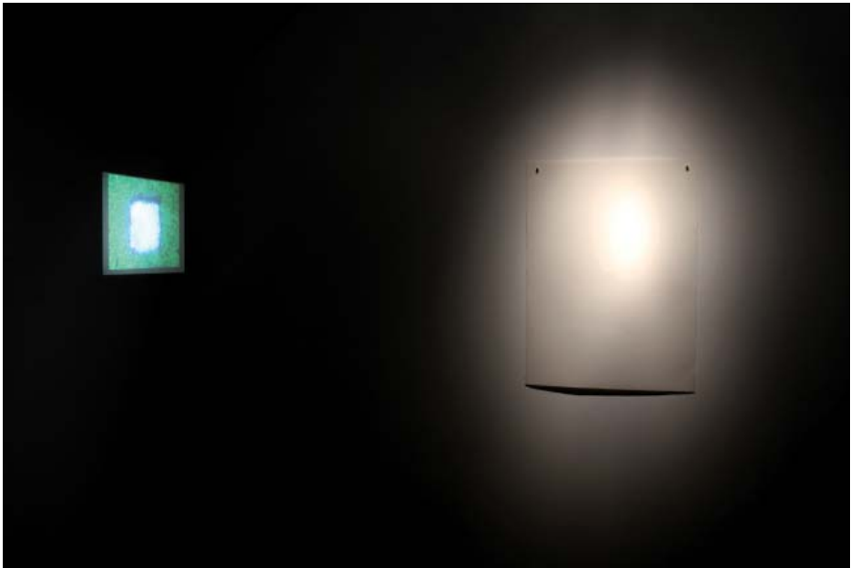
Tamsin Green (2010) Landscape , Video and Paper.

with a rectangular hole dug in the ground to house a piece of glass which is positioned on the same plane as the grass. The glass subtly reflects the sky and in doing so reduces the three dimensional landscape onto a single plane that is then represented two dimensionally on a floating screen.